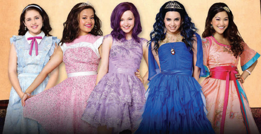
LONNIE Daughter of Mulan

PREMIERES ON DISNEY CHANNEL AND RELEASES ON DVD JULY 31